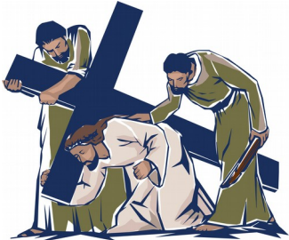
HOLY WEEK SCHEDULE

The Lenten Soup & Services continue on Wednesday evenings: March 2, 9, and 16. We begin with soup and fellowship at 5:30 followed by the service. A sign-up sheet for bringing soup is posted by the church mailboxes.