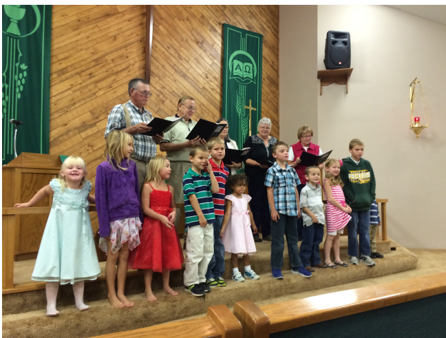
The children joined the adult choir to sing "The Bible Tells Me So" on Sunday, October 5 th .

Our Christmas program will be performed on Sunday, December 14 th during the service.