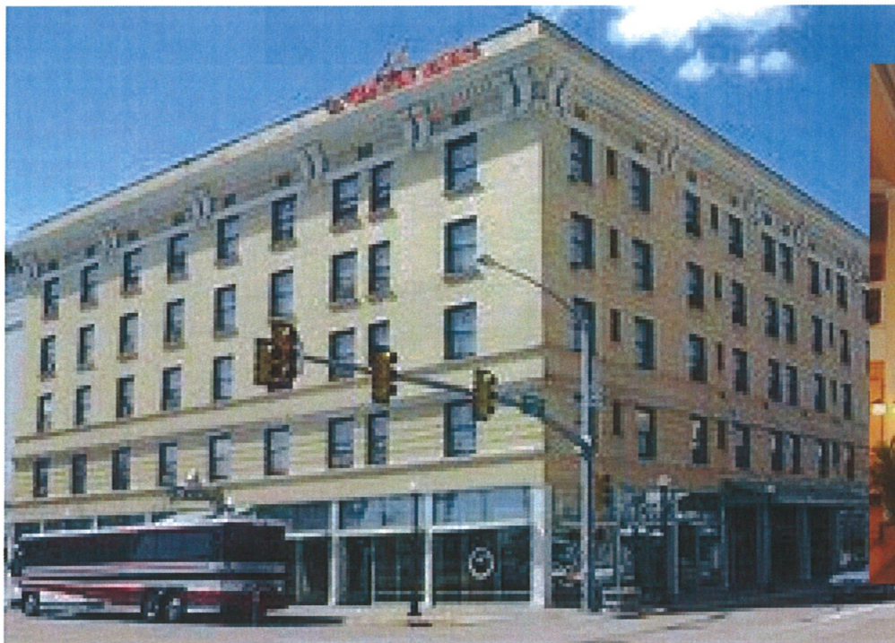
The Plains Hotel